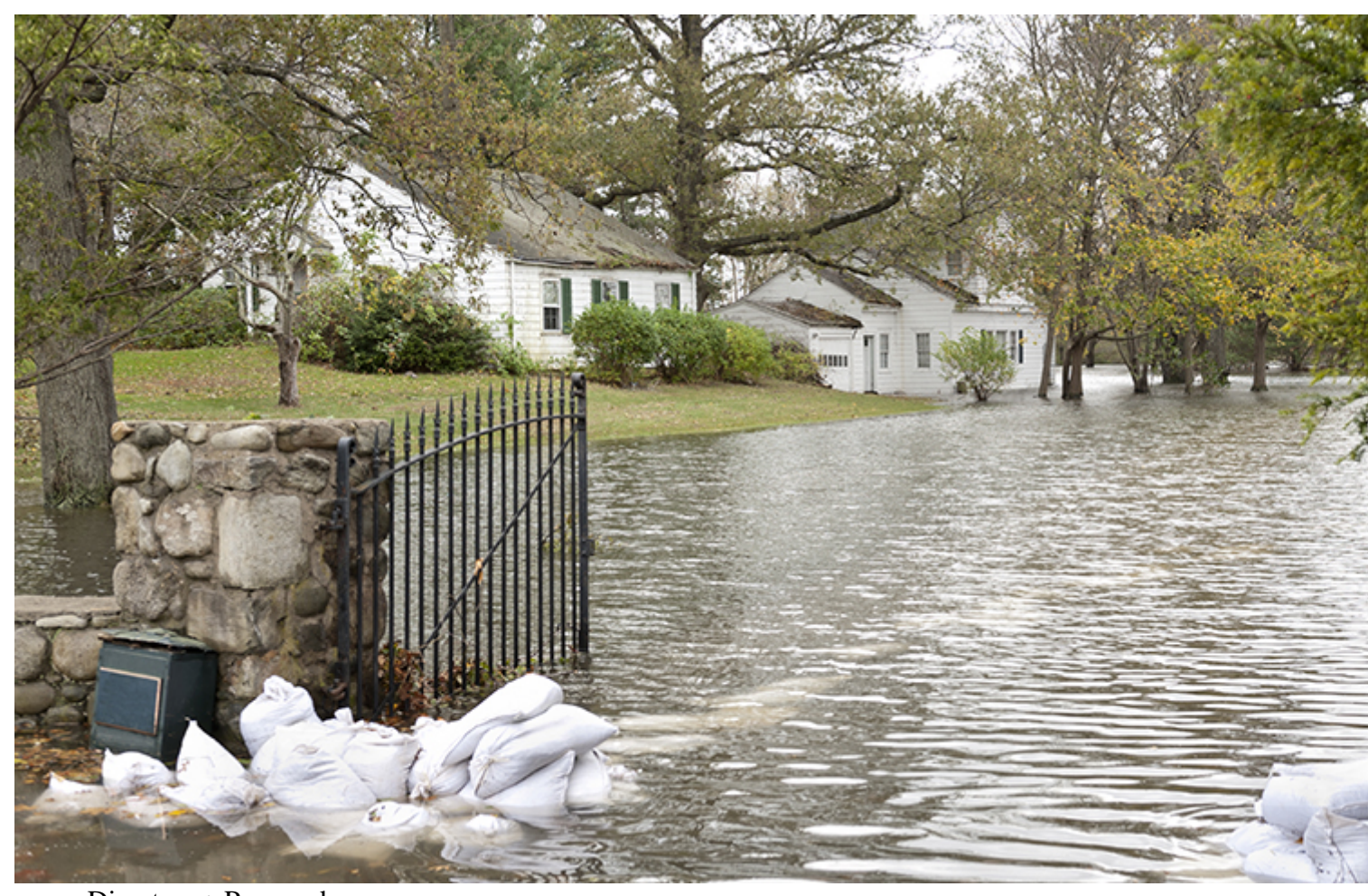
Disasters + Preparedness In case of a flood