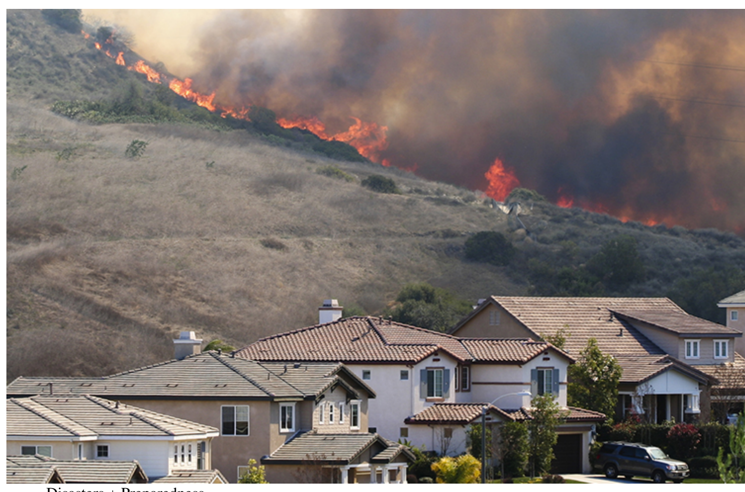
Disasters + Preparedness Five Steps to preparing an effective evacuation plan