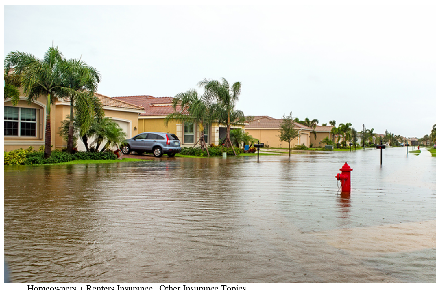
Homeowners + Renters Insurance | Other Insurance Topics Do I need flood insurance for my home?