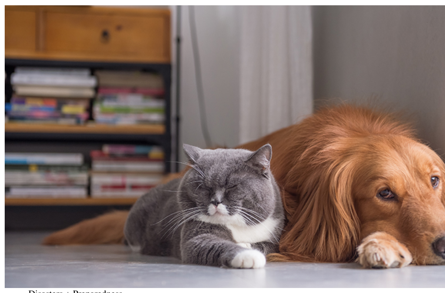
Disasters + Preparedness Including your pets in evacuation and disaster planning