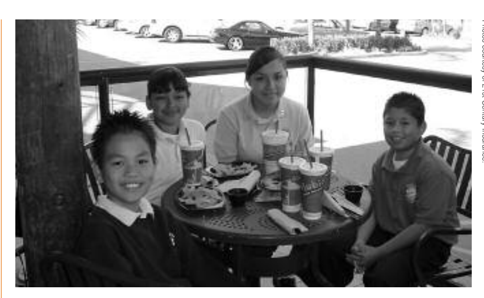
Cadets from Mulholland Middle School celebrate after receiving a commendation from the City of Los Angeles marking the magnet program's 10 years of success.

For the last decade, the magnet school program has offered students hands-on career education in criminology and forensics classes. Los Angeles police officers serve as teachers and mentors. In 2004, Cadet